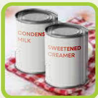
Sweetened creamer/ Condensed milk