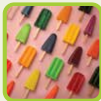
Sweetened frozen food