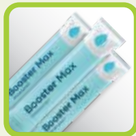
3in1 Sachet product